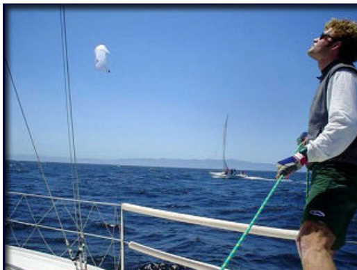
Fig. 1 Match Racing, Sta Barbara

In any mast and sail rig one needs enormous forces to keep the mast from collapsing and to give the sails an efficient shape. The boat (and the sailing rig) must be strong enough to withstand these forces, which are orders of magnitude larger than the propulsion forces that the sails generate. Kites instead are fairly relaxed devices, with no outside forces other than the wind. The kite driving force can be transmitted to the hull directly, with no overturning moment, and no need for a heavy or deep keel, or for a very strong structure. If with kites the wind speed increases to a dangerous level one need not be "over-powered" by too much kite area for more than an instant: the instant needed to "de-power" the kite. One can also simply release the kite, which can then perhaps be recovered later. Kiteships™ can be safer, faster, and more cost effective than the mast and sail rig used on clipper ships, and the cost of retrofitting traction kites on existing ships is relatively small.