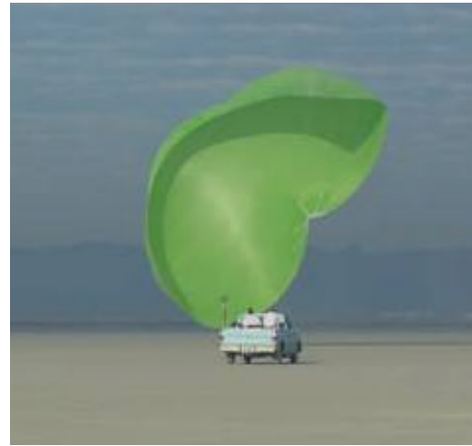
Fig. 4 280 sq m kite pulled by truck

Patent applications have been submitted on both the spinnaker replacement kite and on the manual control device design.