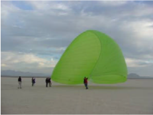
Fig. 3 280 sq m kite on dry lake

square meter) racing spinnaker (Fig. 1), and this 70 sq m kite was later demonstrated in public on our client's boat in New Zealand, as shown in Fig. 2 (24).